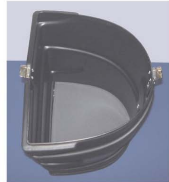
Internal view of case