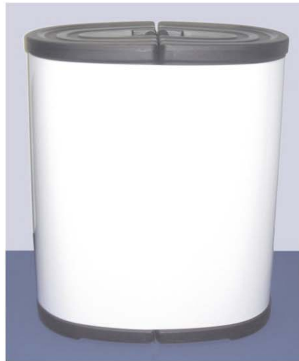
Optional case conversion wrap secured using hook fastener