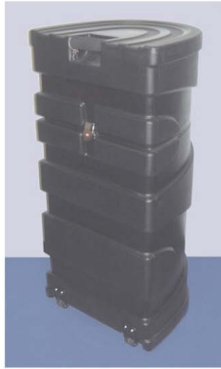
Rear of case