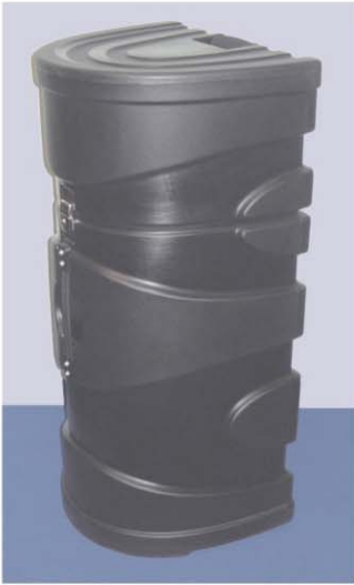
Front of case