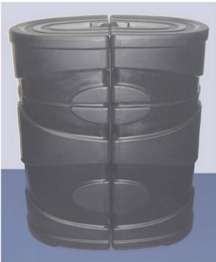
Two cases can be placed together to form a counter top