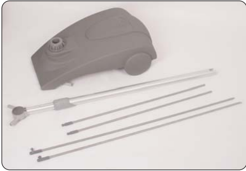
Base, telescopic pole, 2 short support arms and 2 long support arms