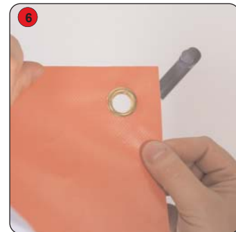
Attach the top graphic eyelets to the long support arms.