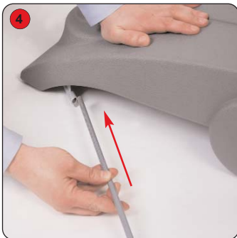
Fit the two short support arms into either side of the base.