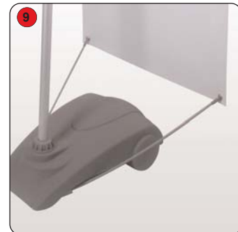
Graphic attached to the base.