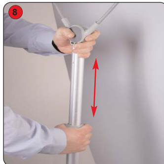
Raise the telescopic pole to the desired height to tension the graphic.