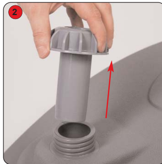
Remove the cap, fill the base with water or sand and re-fasten the cap.