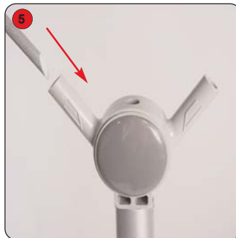
Fit the two long support arms to the telescopic pole hub. Note the orientation of the support arm to the hub.