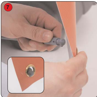
Attach the bottom graphic eyelets to the short support arms.