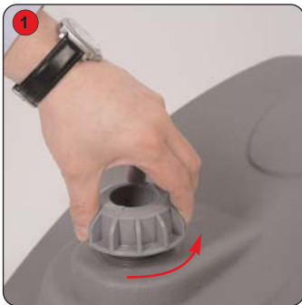
Unscrew the base cap.