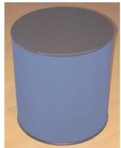
Finally fit the the remainder of the wrap to complete the unit

Assembled size : 400, 800 or 1200mm (H) x Diameter 400mm (depending upon version supplied)