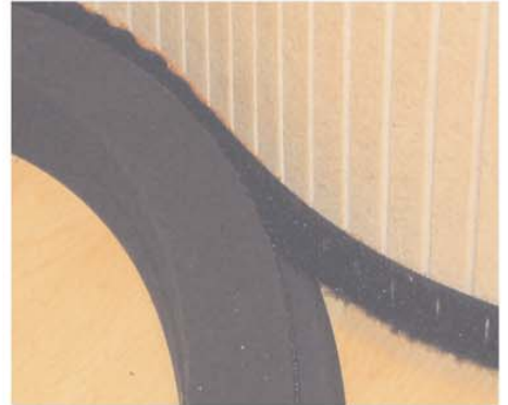
Ensure the hook fastener is fitted securely around the lip of the base and the top