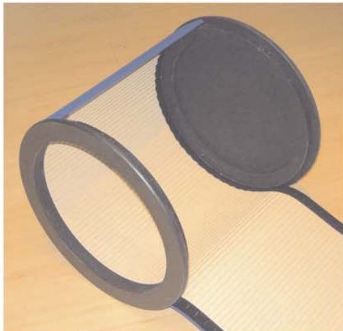
Fit the top to the wrap