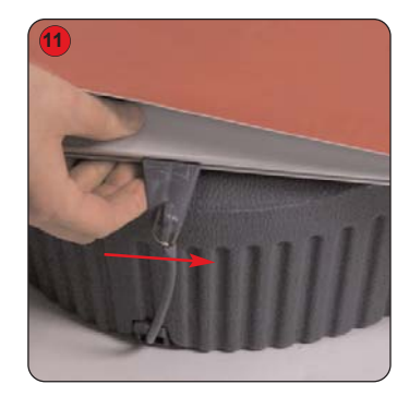
Slide the rail stay cord to the centre of the base.