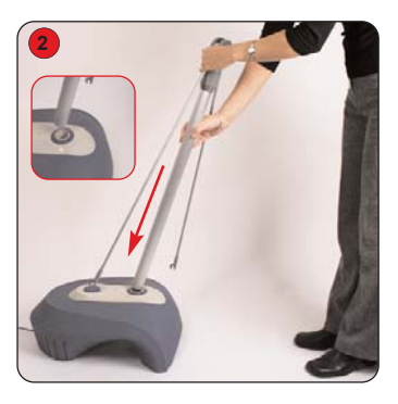
Insert the telescopic pole set into the base.