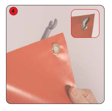
Attach the top graphic eyelets to the support arm hooks.