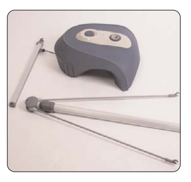
Kit includes: Base, telescopic pole /support arms and bottom rail.