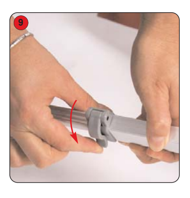
Push down on the lever to lock the rail into place