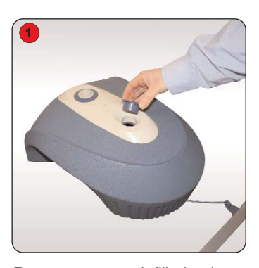
Remove cap and fill the base with water or sand.