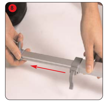
Extend the bottom rail to suit the graphic width.