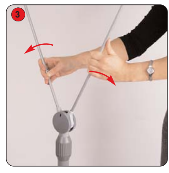
Open out the banner support arms.