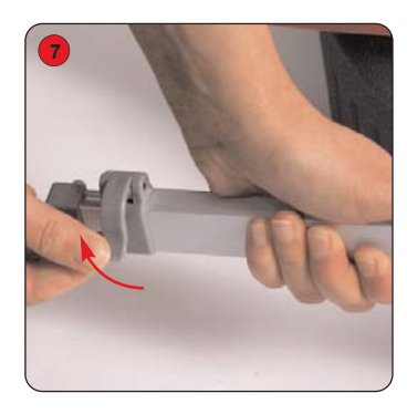
Unlock the telescopic bottom rail by lifting up the lever.