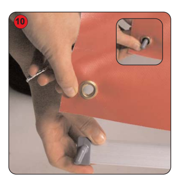
Attach the bottom graphic eyelets to the rail hooks.