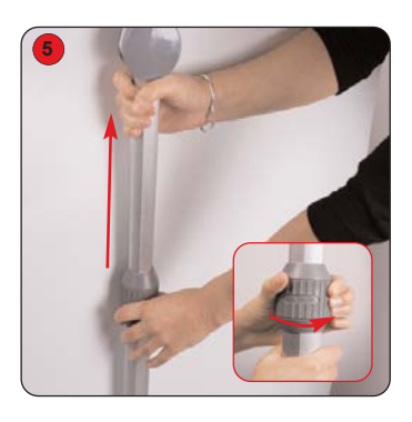
Twist the telescopic pole hub to the right to unlock, then raise the pole to the desired height.