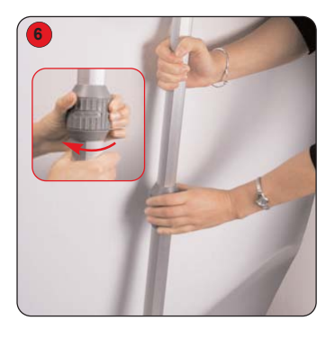
Twist the telescopic pole hub to the left to lock.