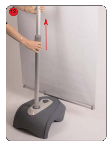
If necessary adjust the telescopic pole to add tension to the graphic.